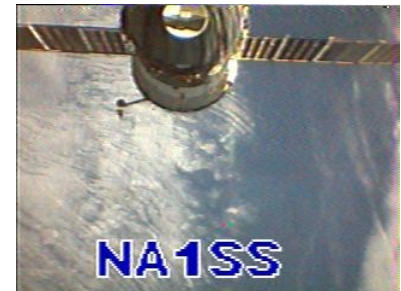
KB1CJ Received this photo via his SSTV station.

This is a good example of where simple equipment can access ISS and amateur radio satellites, many of which can be used as space-based repeaters or transponders. Depending on the satellite, you can use either CW and SSB or FM, in some cases with a simple hand-held. Beacon signals (both CW and packet) and digi-peaters also are available.