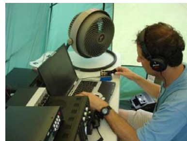
CQ FD DE W1MHL (W1MJ op)